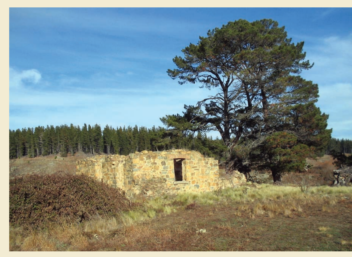
Colliers ruin, June 2006