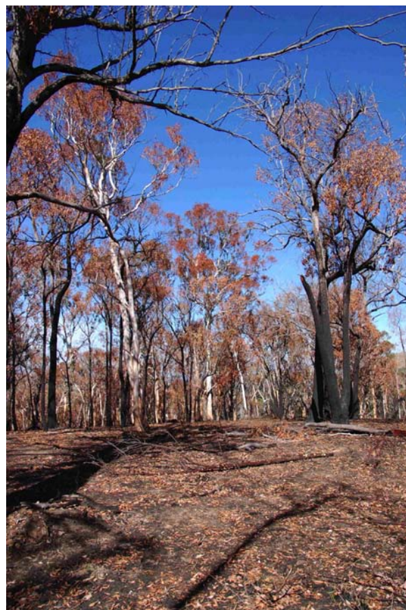
2016: Hot burn, 80% crown scorch